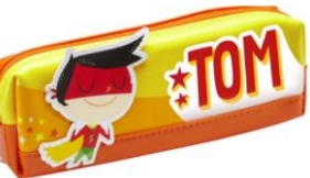
03 Your pencil case