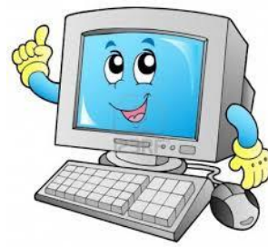
04 Some electronic device