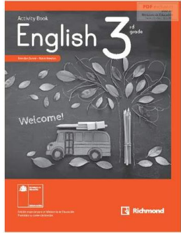
01 Your book